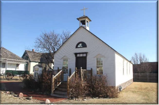
Old Church, DodgeCity, KS

Annual Conference Sept. 14 – 15 Church of the Resurrection Leawood, KS