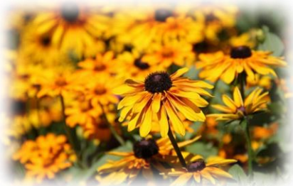
Sunken Gardens in Lincoln, NE